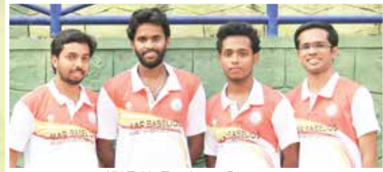
KU Table Tennis -1st Runner-up