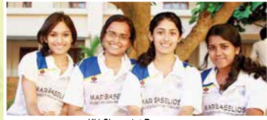
KU Chess-1st Runner-up