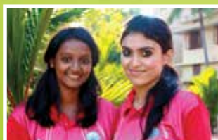
KU Shuttle Badminton-1st Runner-up