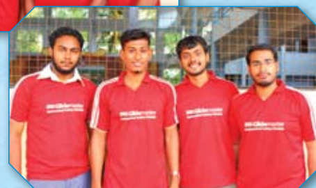
Lawn Tennis Men