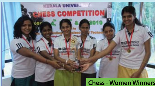
Chess - Women Winners