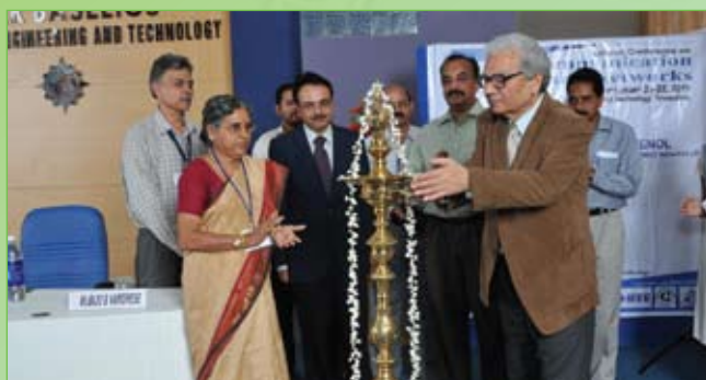
Inauguration of CoMNet 2010

The conference aimed at providing a forum for Researchers, Industrial Professionals and Academicians to discuss the recent developments in optical, microwave and wireless communications, broadband networks, sensor networks, network architectures and protocols, network security and so on.