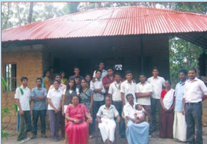
THANAL - Housing for the Poor

The members of THANAL visited SISU BHAVAN, a Rehabilitation Centre for children on 9 October 2010. Frequent visits were made to the Mother Theresa Orphanage. Food, gifted articles and clothes were distributed to children. A House for the Homeless Project at Kilimanoor in collaboration with the Alumni is underway.