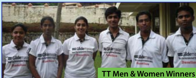
TT Men & Women Winners