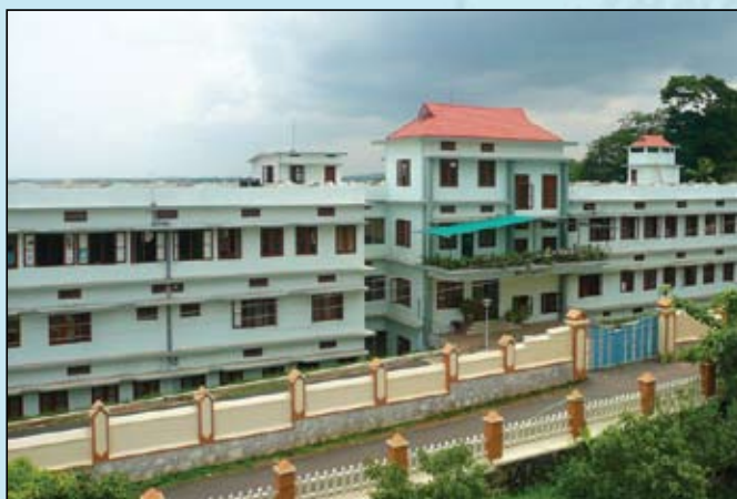
Mar Ephraem Men's Hostel

This academic year also was eventful for the 275 inmates of the Hostel. Onam celebrations were held this year too, in which various competitions in Athappokkalam, Tug-of-war etc were conducted, dividing the inmates into four houses. A colourful but meaningful Christmas Carol was conducted, spreading the message of peace and harmony. The Carol Team visited all the Institutions in the Mar Ivanios Vidya Nagar.