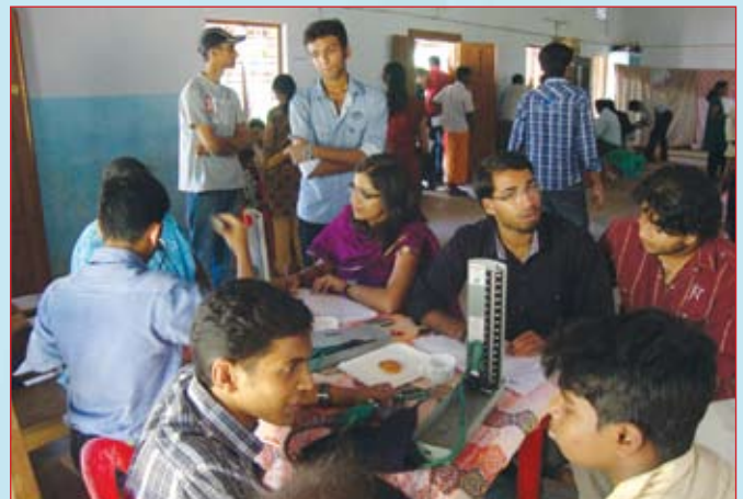
THANAL - Medical Camp