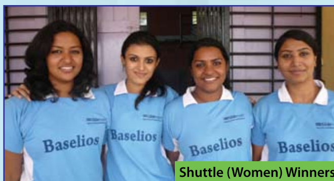
Shuttle (Women) Winners