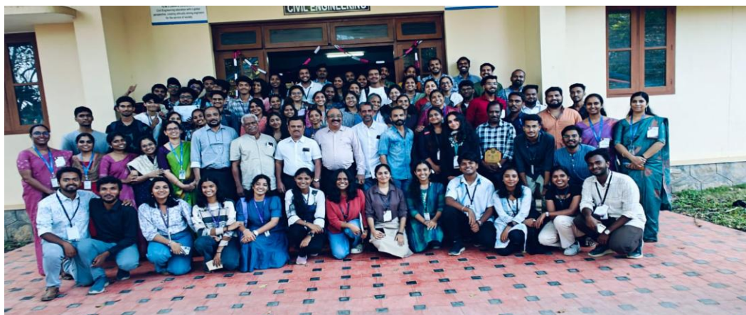
World plumbing day celebration