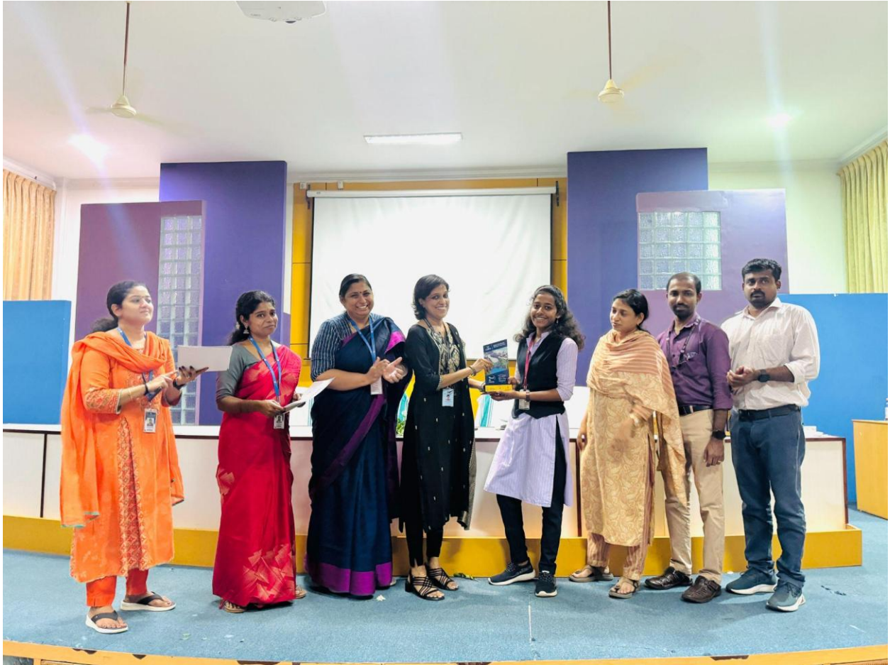
Fig.5: Quiz Competition Prize distribution

Department of civil engineering in association with Water Management Cell and Engineer's Federation of Kerala Water Authority also conducted an online quiz competition of which the swiftest and sharpest 10 were selected and given special prizes.