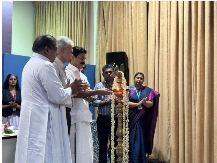
Fig.1: Inauguration of World Water day celebration

The event highlighted the importance of water conservation and sustainable management for Kerala's future.