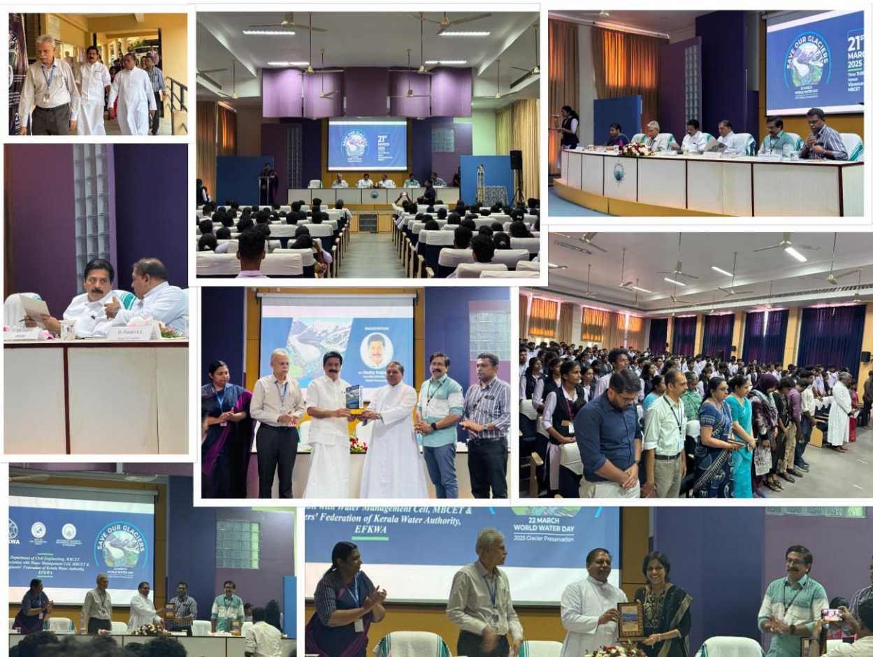
Fig.2:MoU Signing between Kerala Water Authority and MBCET