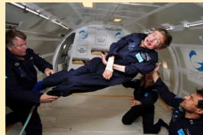
Hawking taking a zero-gravity flight in a reduced-gravity aircraft, April 2007

Before he departed us for worlds beyond, Stephen Hawking delivered the following final speech: "...I realized there is life; there is hope. There are many ambitious experiments planned for the future. We will map the positions of billions of galaxies. We will better understand our place in the universe. First, we must also continue to go into space for the future of humanity. I don't think we will survive another 1000 years without escaping beyond our fragile planet. It has been a glorious time to be alive doing research in theoretical physics. The fact that we humans, as collective fundamental particles of nature, have been able to come this close to an understanding of the laws governing us and our universe is a great triumph. I am happy if I have made a small contribution. I want to share my excitement and enthusiasm about this quest. So remember to look up at the stars and not down at your feet. Try to make sense of what you see and wonder about what makes the universe exist. Be curious, and however difficult life may seem, there is always something you can do and succeed at. It matters that you don't first give up. Well, there is life, there is hope."