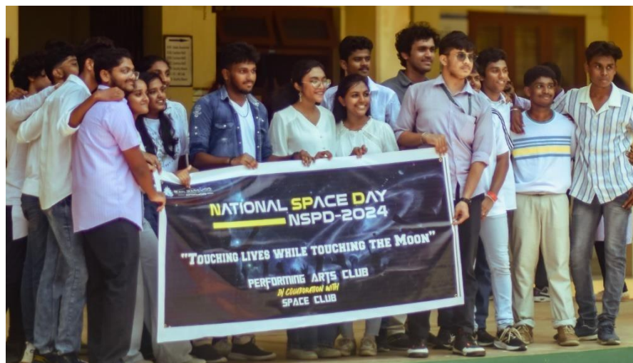
Fig:2 National space day celebration

The Stellar Spectacle was a resounding success, showcasing the artistic talents of MBCET students while celebrating the grandeur of space. This collaborative effort by the Performing Arts and Space Clubs was a testament to the creativity and versatility of the MBCET community, leaving a lasting impression on all attendees.