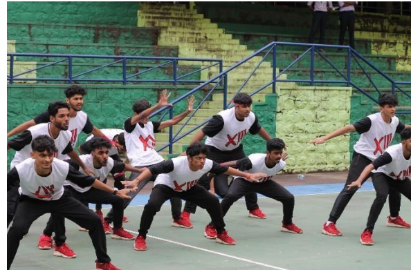
Fig:4 Dance Showcase