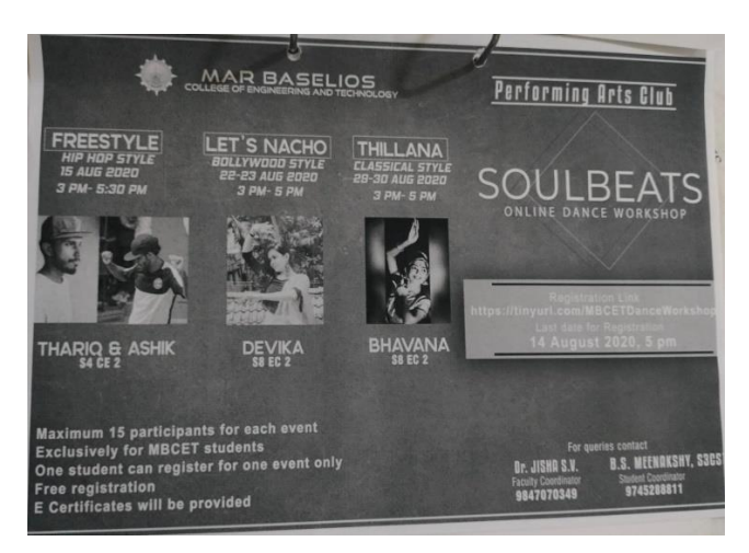
Fig:8 Poster of SoulBeats Online Dance Workshop