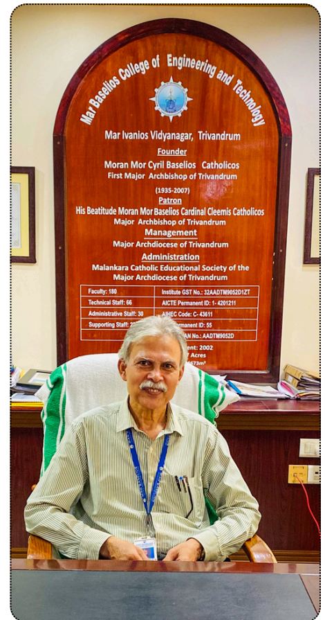
The New Principal