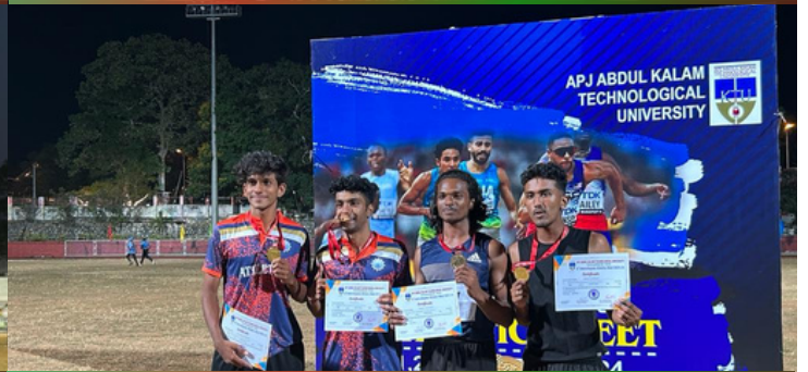
MBCET Men Relay Team