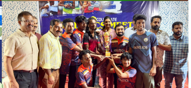
MBCET Men Athletics Team