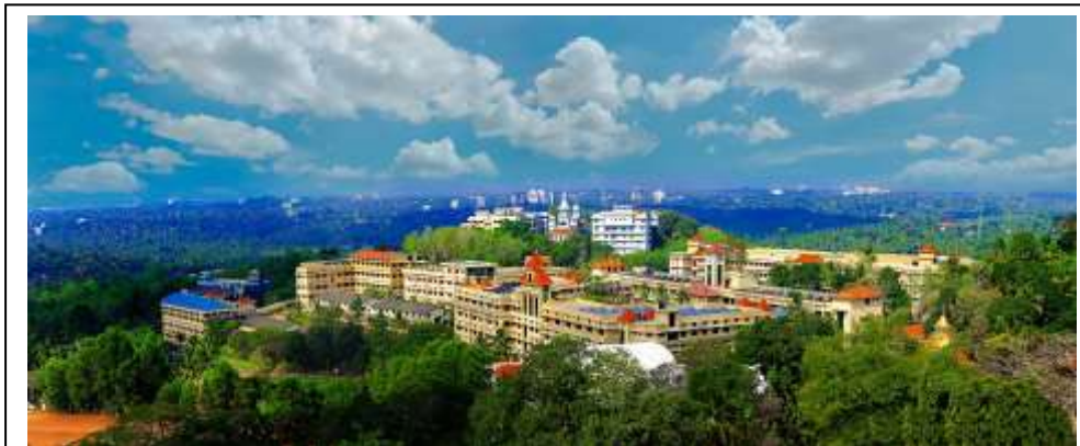
Aerial view of Mar Baselios College of Engineering and Technology campus

Mar Baselios College of Engineering and Technology