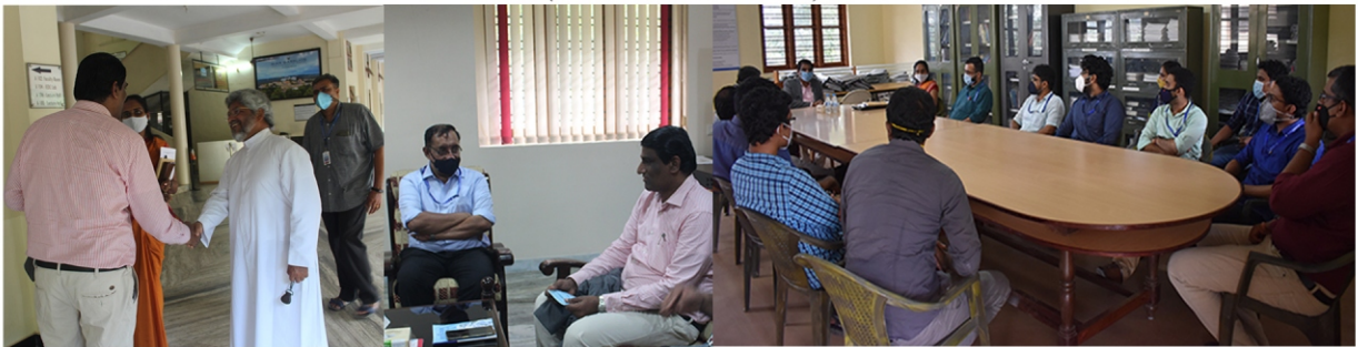
Bursar receiving the Guest