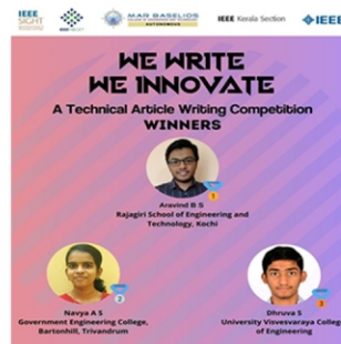
IEEE Special Interest Group on Humanitarian Technology (SIGHT) of MBCET and IEEE SIGHT Kerala Section jointly organized a technical article writing competition 'WE WRITE WE INNOVATE' on 7th