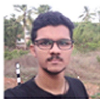
CATALYZER"- an automatic hand sanitizer dispenser, designed by